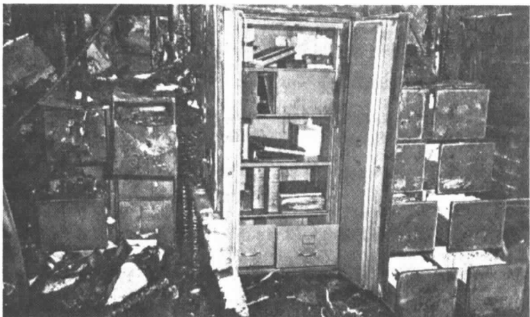
Figure 4-3.1 These two pictures of the same equipment show graphically the value of fire-rated containers for protection of records. These containers were in a 1-story brick and steel building destroyed by a 5-hr fire. The 1-hr rated equipment at the right and the 2-hr rated safe in the center protected their contents. Records in the non-rated equipment at left were destroyed.