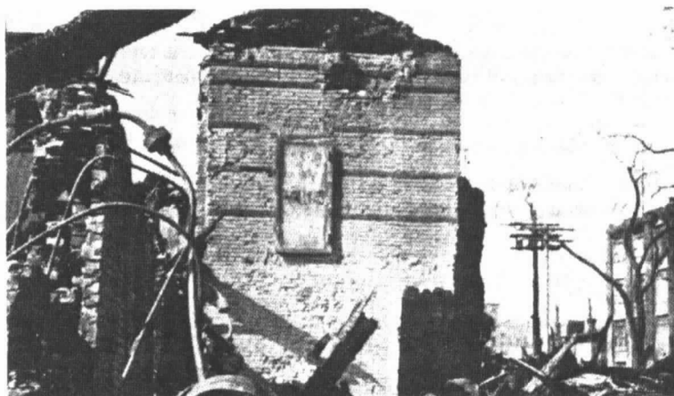
Figure 2-10.1(b) Satisfactory performance of a labeled vault door saved records in the upper story of this 2-story vault. A labeled fire door (not a vault door) at the first story level was damaged and records in the first story were destroyed. Figure 2-10.1(a) shows the fire exposure to vault.